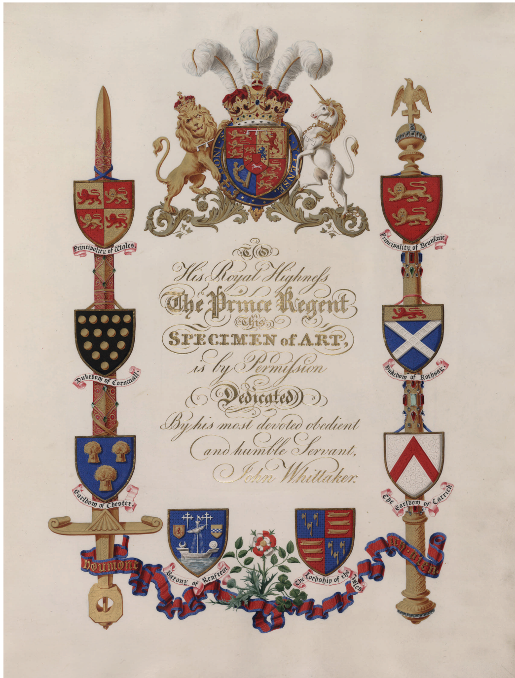
Magna Carta Regis Johannis XV. die Junii anno regni XVII A.D. MCCXV. (LCCN: 2004572905)